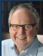
Dr. Michael Fullan, O.C.