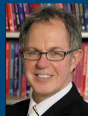
Dr. Andy Hargreaves