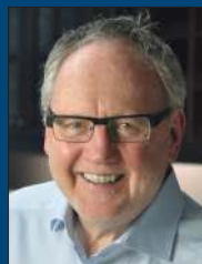
Dr. Michael Fullan, O.C.